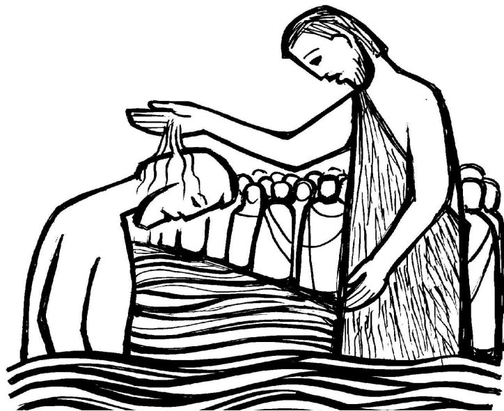
Christ, the beloved of God

A voice spoke from heaven, 'This is my Son, the Beloved; my favour rests on him'. That is the very heart of our Christian faith. Christ is the Son of God. The practice of our faith is about living with that conviction and living it enthusiastically. In believing that Christ is the Son of God we are acknowledging that he is the one who can teach us what God is like. And he teaches us that God adores us, the way a parent adores her/his newborn child. We need to let ourselves go to that wonderful love in prayer and in joy. Christ is also the one who teaches us human life. He tells us very clearly that the only way to live is to love as he has loved us. This is particularly true in the intimate relationships of marriage and family life. It is also true in how we build our community of faith. We are a very privileged people.